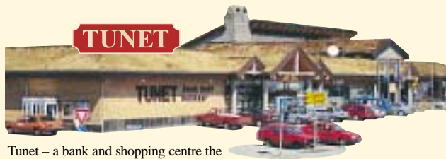
Tunet – a bank and shopping centre the likes of which you've never seen before.

Oystese – a beautiful holiday destination on the northern shore of the Hardangerfjord affording good views of the Folgefonna glacier. Oystese is only 80 km. from Bergen and can offer beaches, boat hire, sea and fresh-water fishing, a riding centre, goldfish lake, hiking trails, history trail, forest and mountain walks throughout the year. Oystese is an excellent point of departure for day trips on the fjord or in the mountains.